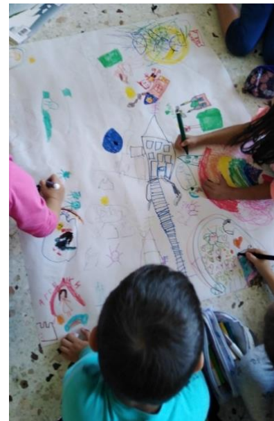
First grade students at a primary school in Greece – that have not yet learned how to read and write – express themselves by drawing a story "with numbers and images", dancing and listening to fairy tale form different countries

The workshops and the piloting activities are organized by the local schools with the support of Symplexis, and the project staff and the teachers from all the participating schools meet online every few weeks to exchange experiences and ideas, talk about the highlights of their activities and share insights about the progress in their schools.