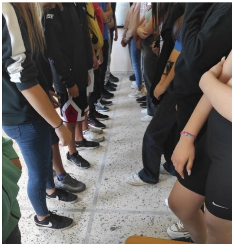
First grade students at a secondary school in Greece share experiences while playing the "Approach the line if..." game. Students stand in two lines facing each other, and every time they hear a situation, characteristic, experience or feeling with which they identify, they take a step forward.

Drawing on the project's Workshop Manual and guided by their teachers, the students performed various activities and played games, had the opportunity to learn more about each other, the myths and prejudices often associated with migrant and refugee population, exchange experiences and have fun!